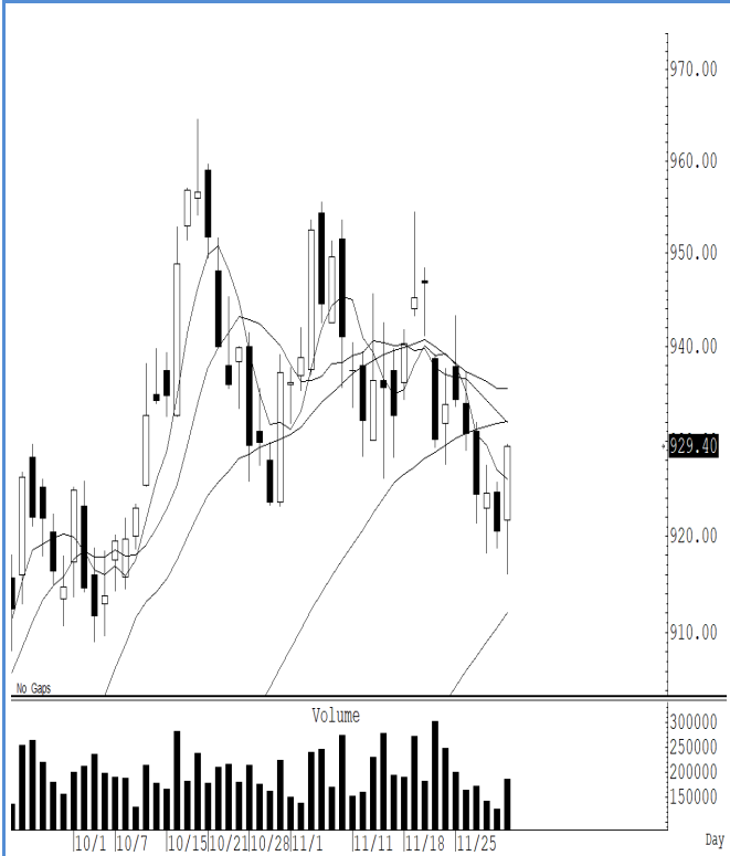
S50Z24 (Close 929.40 Chg 8.90)